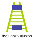
the Ponzo illusion